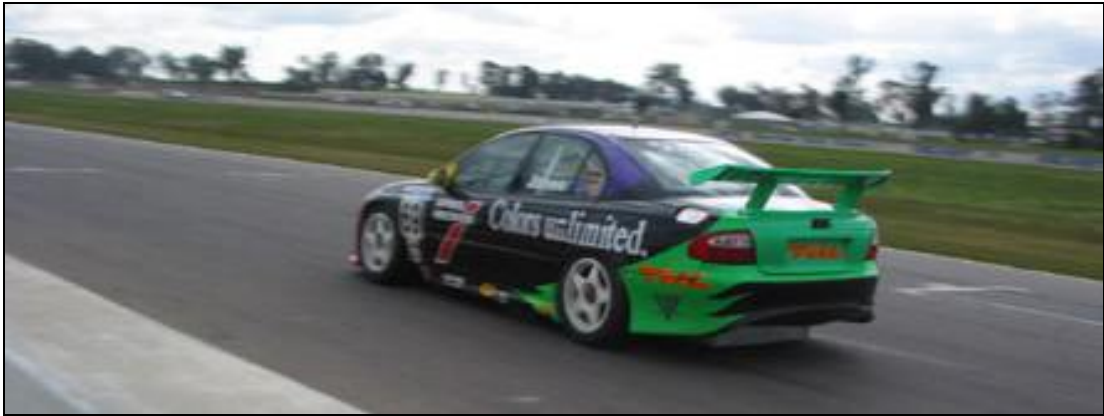
coming or going... Robbie was quick