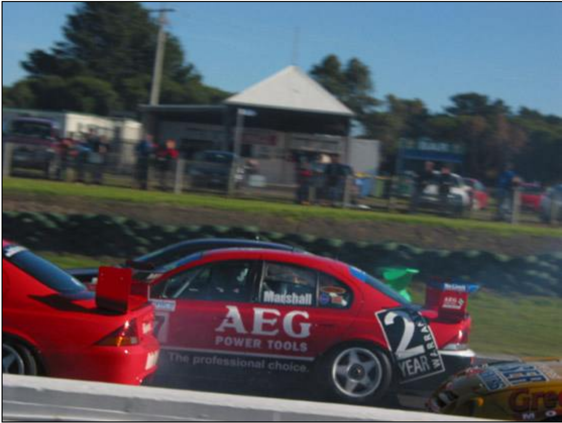
Above: Robbie gets a great start and slingshots up the inside (green rear spoiler is visible)