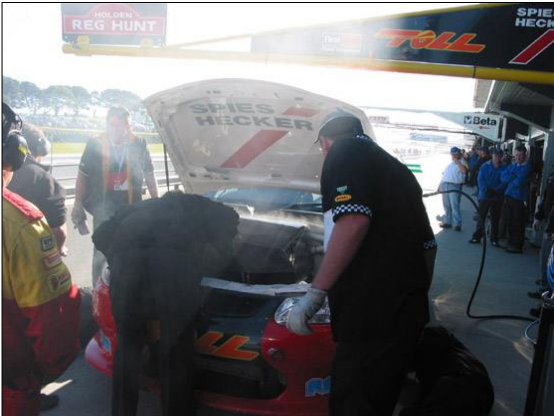
Above: a cloud of oil smoke cuts short a fantastic weekend